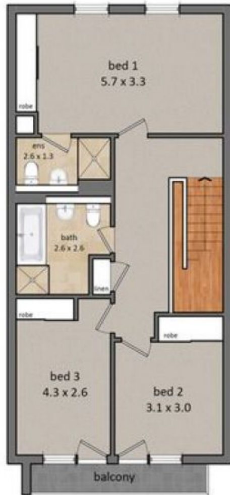
first level floor plan