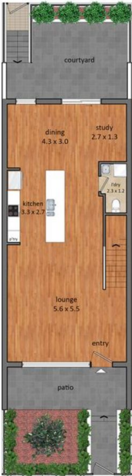
ground level floor plan