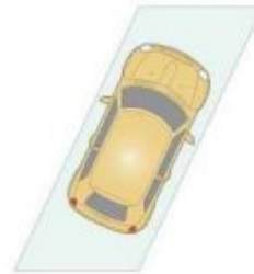
CAR SPACE 13 SQM